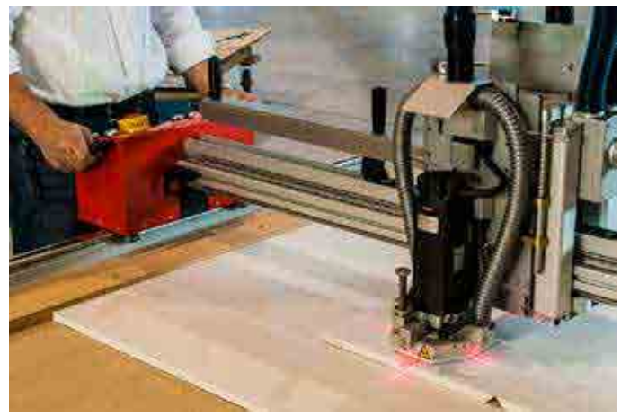
Rout assembly with the PanelMax panel fabrication machine

Use the PanelMax panel fabrication technology to create profiles and details that were previously difficult and time-consuming to create. Use the specially formulated PanelMax system of primers and adhesives to securely bond corners and assemblies Don't take chances with untested and inferior materials