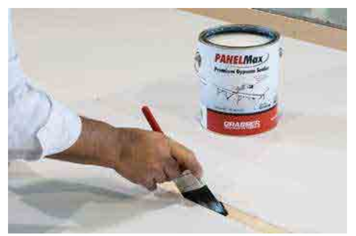
Prime and seal exposed gypsum using PanelMax primer