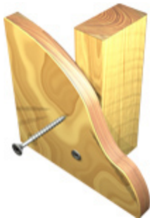
Flat Head Ribbed Coarse Thread

Certifications: All GRABBER® screw products are manufactured in facilities that are ISO 9001 certified. The fasteners comply with ASME B18.6.1. ©2012 GRABBER Construction Products, Inc. GRABBER®, STREAKER®, DRIVALL®, LOX®, GRABBERGARD® and SCAVENGER® are registered trademarks of Grabber Construction Products, Inc.