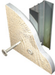
Flat Wafer Head High Density Winged Drill Point

All GRABBER® screw products are manufactured in facilities that are ISO 9001 certified. The fasteners comply with ASTM C1513. Specific fasteners are listed in ICC ESR-4223; please check the report for listed item numbers. ©2012 GRABBER Construction Products, Inc. GRABBER®, STREAKER®, DRIVALL®, LOX®, GRABBERGARD® and SCAVENGER® are registered trademarks of Grabber Construction Products, Inc.