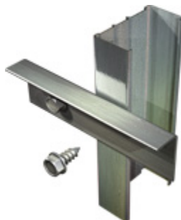
Hex Head Fine Thread Streaker®

Certifications: All GRABBER® screw products are manufactured in facilities that are ISO 9001 certified. The fasteners comply with ASTM C1513 specifications and requirements. ©2012 GRABBER Construction Products, Inc. GRABBER®, STREAKER®, DRIVALL®, LOX®, GRABBERGARD® and SCAVENGER® are registered trademarks of Grabber Construction Products, Inc.