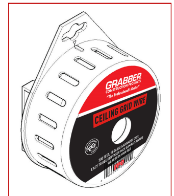
#TW18300S, 18ga. x 300-ft tie wire spool.

Used to support grid work for stucco, acoustical, and drywall ceilings. Refer to ASTM C1063 for support spacing, fastener selection, and further information regarding proper installation.